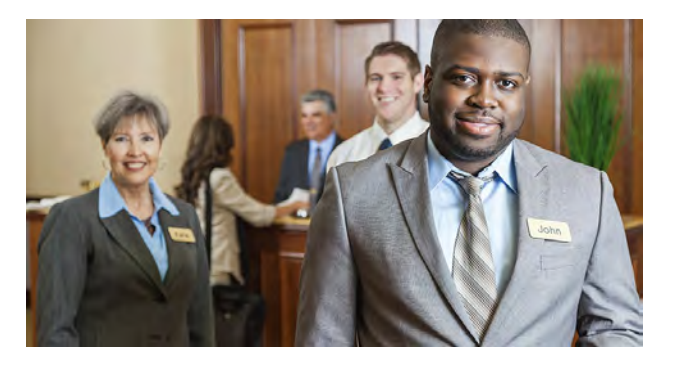
Graduates may find employment for supervisory and managerial positions in hotels, restaurants, institutions, and clubs.